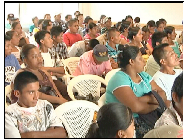
SATIIM and Maya communities’ press conference held on Tuesday 23 rd July 2013.

On Tuesday 23 rd of July, SATIIM and the named Maya communities held a press briefing in Punta Gorda Town in Toledo in southern Belize, to explain why they are taking a stand against the oil company and the government. They claim that oil drilling in the national park is unlawful and contrary to the National Parks System Act and the Petroleum Act and is therefore ultra vires, unlawful and void. It is unlawful as having been made without the free, prior and informed consent of the Indigenous Q’eqchi’ Maya communities represented by the claimant.