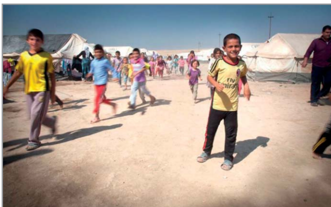
Yezidi children in a camp in Zakho, Iraq, near the Turkish border.

The IDP population in Iraq originates from 8 of the country's 18 governorates, though the majority of IDPs come from the governorates of Anbar (42 per cent) and Ninewa (35 per cent). Ethnic and religious minorities have been disproportionately affected: most of the minority population 107 have either sought refuge in the KR-I or in provinces in southern or central Iraq. 108