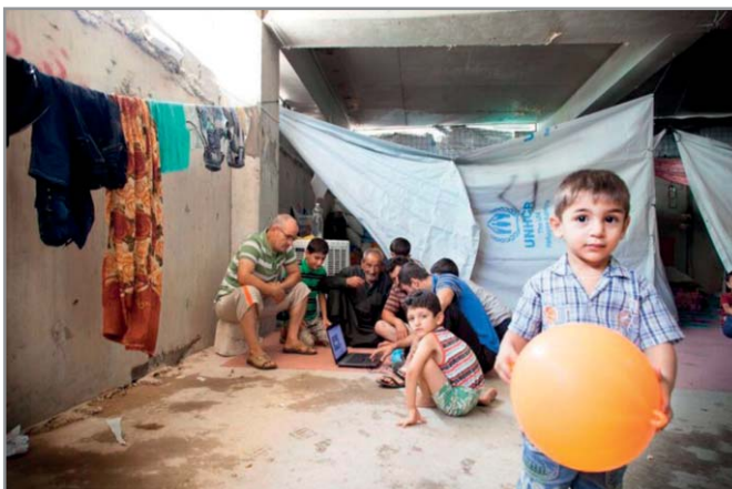
With no place to stay Assyrian Christians are forced to live underground in unfinished buildings.

On 21 June 2015, local media reported that ISIS had abducted 1,227 children aged between 9 and 15 years from various districts of Mosul. The children were reportedly being forced to undergo training at ISIS camps on the eastern outskirts of Mosul. On 23 June, the then-Ministry for Human Rights issued a statement confirming the abduction, adding that they were being held at the al-Salamiya camp in Mosul, and that those who resisted ISIS orders were whipped, tortured or sexually assaulted. The children were divided into two groups: those between 5 and 10 years old were placed in a religious education camp, and those aged between 10 and 15 were forced into military training. 38