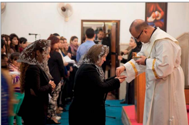
Christians at a Communion in Iraq.

The Shabak community have been located for centuries in the Ninewa plain area, between the Khazir and Tigris rivers and near Mosul, with a population of 200,000–500,000. 6 The