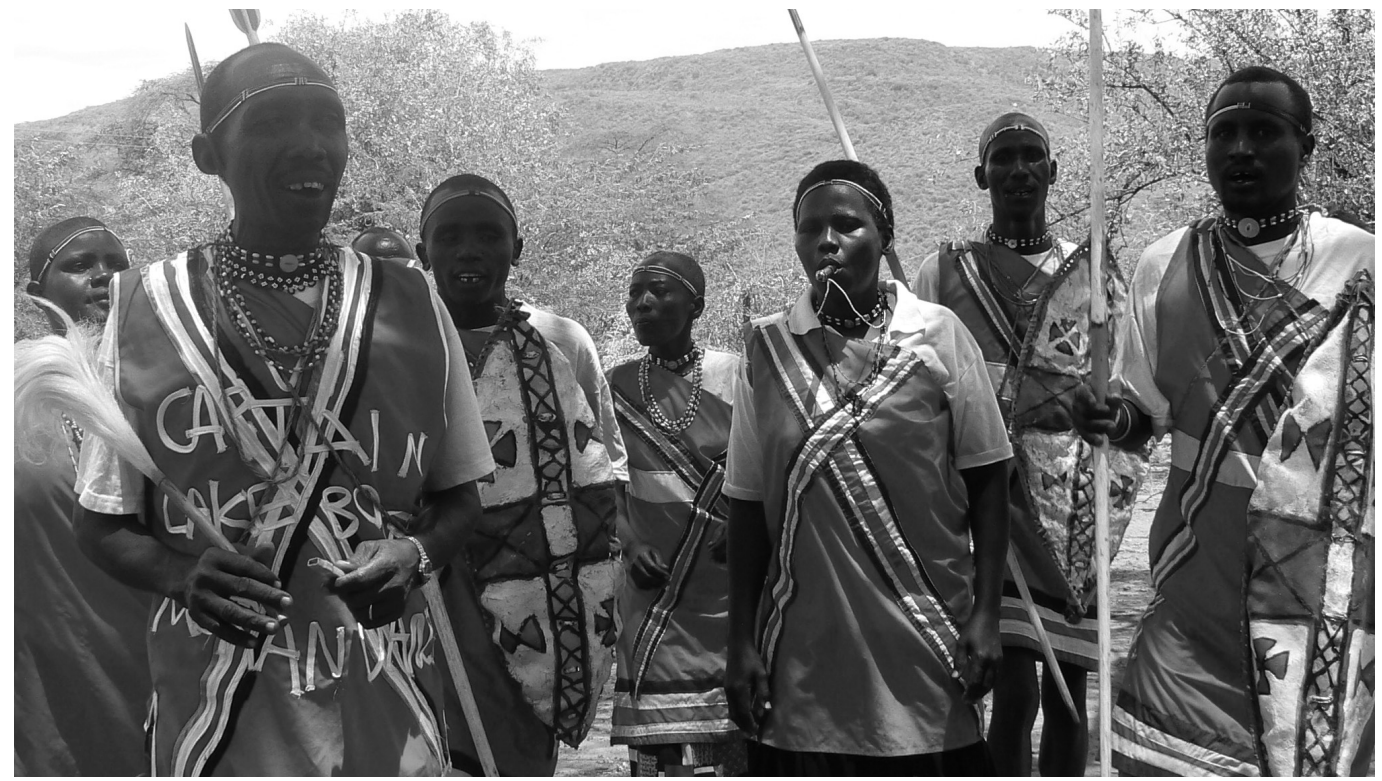
Members of Kenya's pastoralist Endorois community.

MRG and Kenyan non-governmental organization Centre for Minority Rights Development (CEMIRIDE) lodged a complaint with the African Commission in 2003, claiming that the Kenyan government had violated the African Charter by failing to recognize and protect