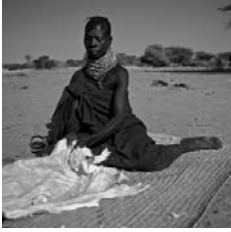
A Turkana woman prepares a hide for use as clothing in the village of Kache Imeri, Turkana district, Kenya.