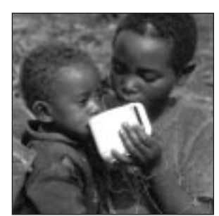
Internally displaced people. Child looking after his younger sibling.

As part of its methodology, MRG conducts regional research, identifies issues and commissions Reports based on its findings. Each author is carefully chosen and all scripts are read by no less than eight independent experts who are knowledgeable about the subject matter. These experts are drawn from the minorities about whom the Reports are written, and from journalists, academics, researchers and other human rights agencies. Authors are asked to incorporate comments made by these parties. In this way, MRG aims to publish accurate, authoritative, well-balanced Reports.