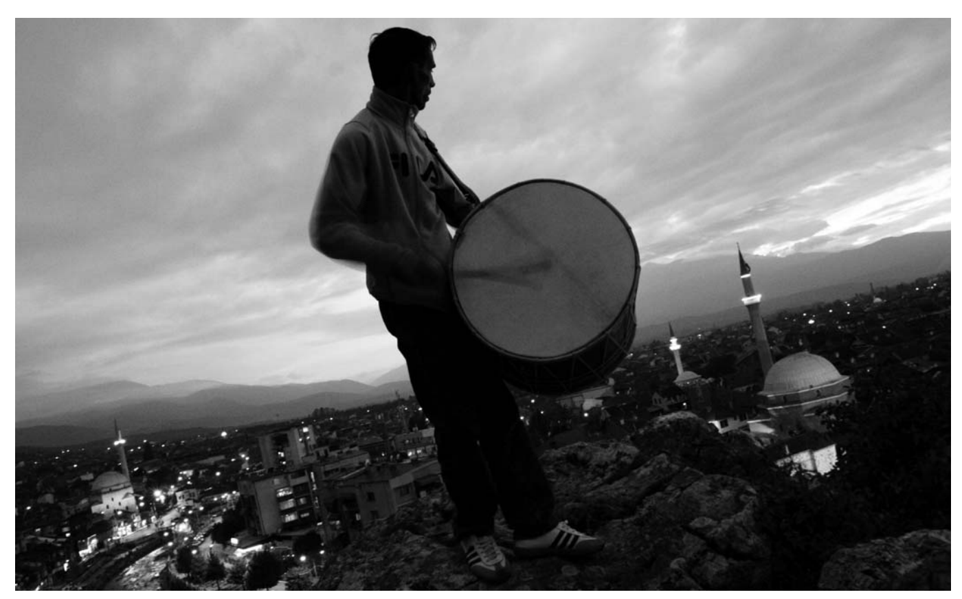
A Roma musician in Prizren, Kosovo, playing a drum at sunset during the month of Ramadan, signaling the end of the fast.

Kosovo is a small territory, but it is home to a plethora of different communities. It is too often forgotten that