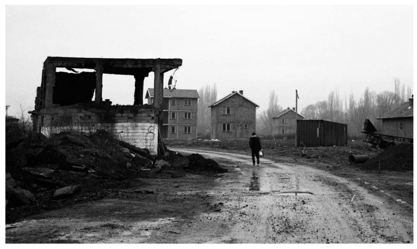
New houses in the Roma district of Mitrovica, Kosovo. Destroyed after the 1999 war, the neighbourhood is now being rebuilt and the Roma will be encouraged to move back into the area.

recognised that living in ghettos or isolated villages is not a long-term solution and that such segregation is not sustainable. People in 'Serb' or 'Albanian' villages cannot live in isolation from cities, or from the jobs and services that can only be found in such areas.