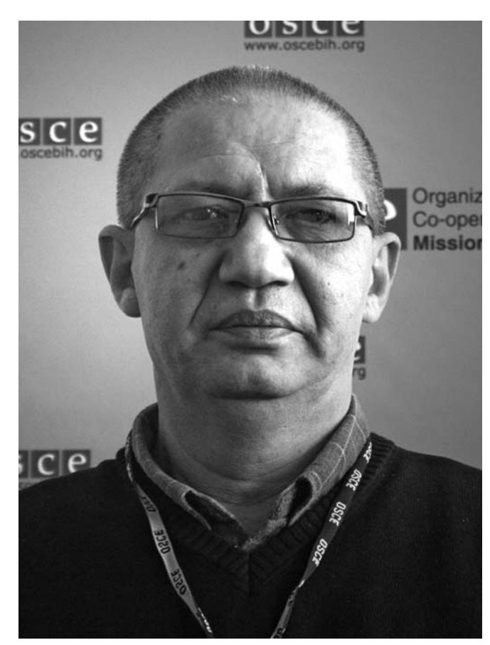
Dervo Sejdić/image © OSCE

The allegation of discrimination under Article 14 was contingent upon the right protected by Article 3 of Protocol 1, the right to free elections. Free and fair elections ensure that individuals are able to participate in the politi-