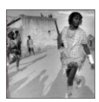
Traditional ceremony of the Kunama tribe.