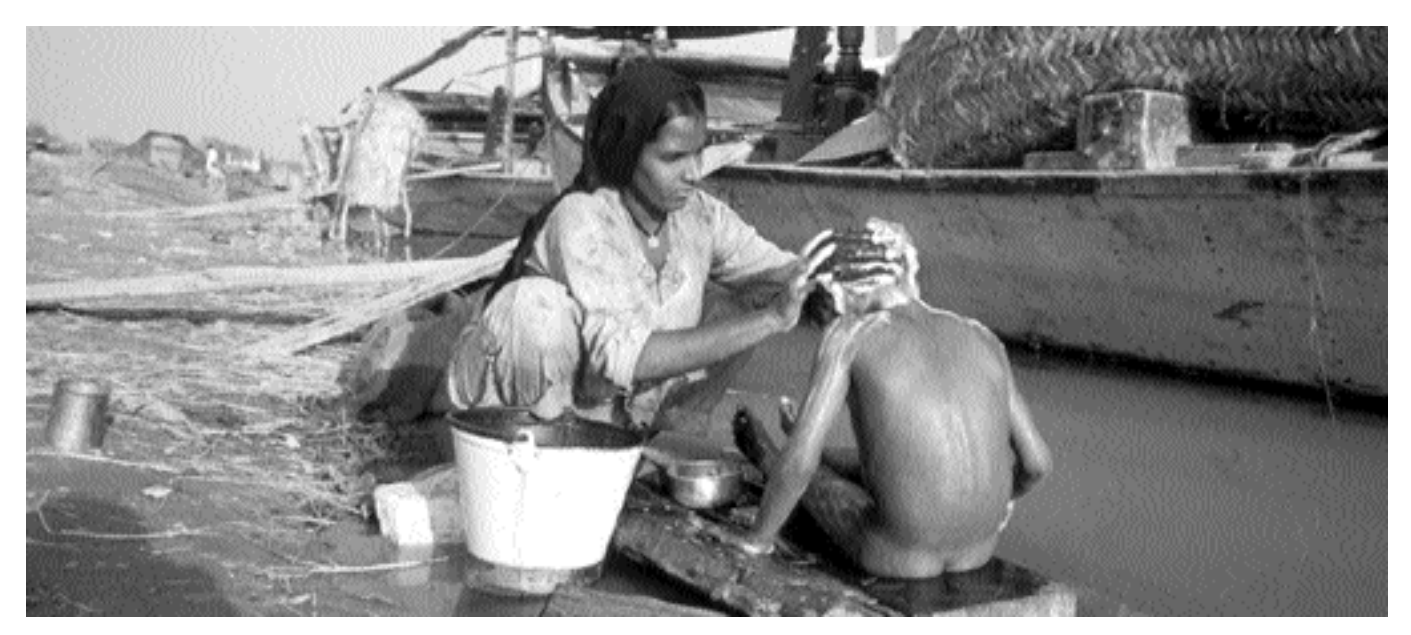
Washing on the banks of the Indus, Pakistan