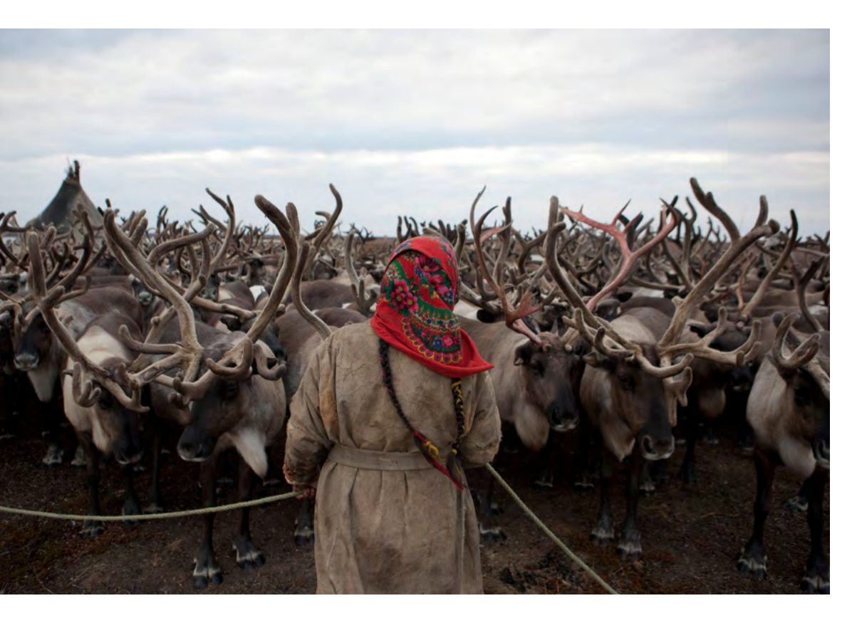
A Nenets woman herding reindeers in the Western Siberian Yamal Peninsula, Russia.