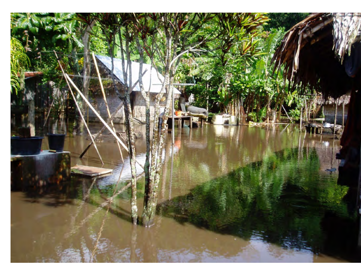
A flooded village in Vanuatu.

Encouraging the use of the official languages, particularly Bislama, are developments in communication and transportation. A mobile phone network, launched just over 10 years ago, now connects islands that never had landline capabilities, and a new ring road on the main island of Efate greatly eases movement between communities previously accessible to one another