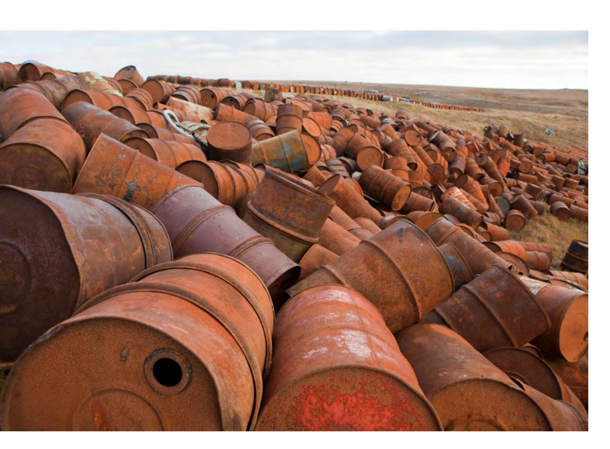
Empty oil barrels discarded on Nenets traditional land in the Western Siberian Yamal Peninsula, Russia.

access to medical services as they are forced to camp further from towns. Nenets can adapt by continuing to roam widely in search of pastures: the issue is whether mining and natural gas extraction will hamper their access to the necessary range of habitats. Ever-expanding gas and oil industries encroach on reindeer pasture territory, and so regions on the Yamal Peninsula (where the nomadic Nenets live and move around) are overgrazed. In addition, the new pipelines and other industrial infrastructure are creating further obstacles to traditional migration routes.