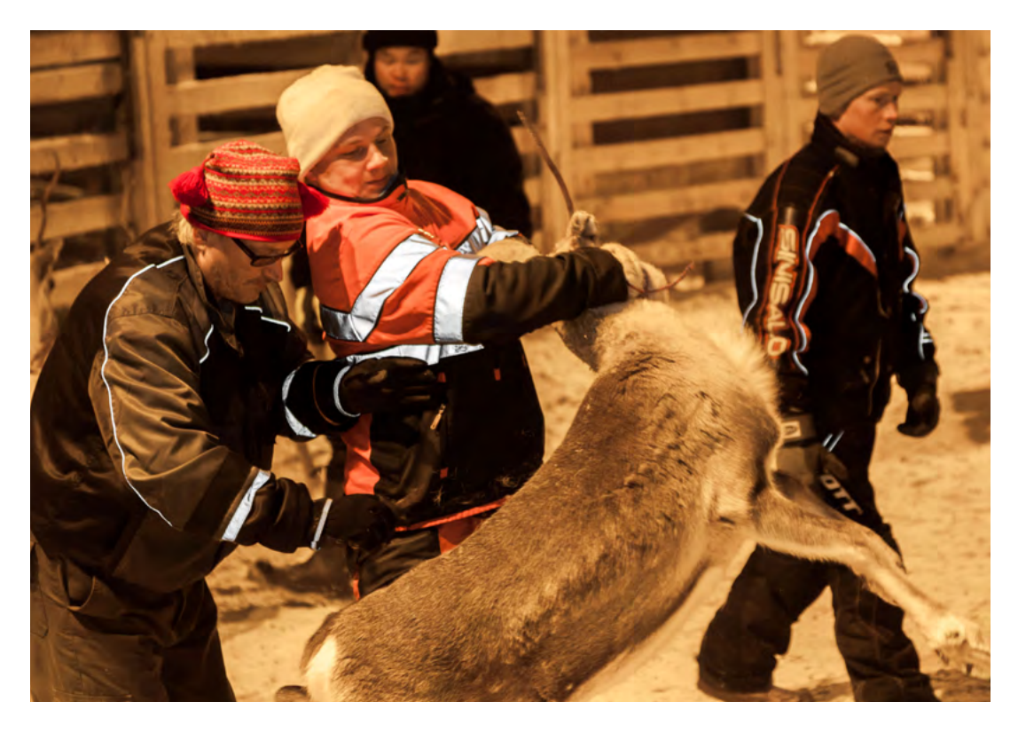
Reindeer separation by Sámi herders in Inari, Lapland, Finland.

Reindeer-herding as a livelihood can adapt to climate change with the help of additional feeding and technology, but reindeer-herding as a Sámi cultural livelihood is greatly endangered in Finland. Changes in traditional livelihoods directly affect the Sámi identity and the vitality of the their culture. In addition to the Sámi languages, they are a link to the early history of Sámi culture. Climate change, on the other hand, may accelerate the trend of Sámi people moving out of their native region, but at the same time increase the number of the majority population moving in.