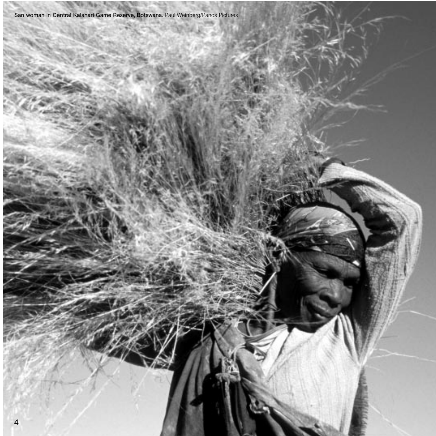
San woman in Central Kalahari Game Reserve, Botswana.

Over three-quarters of those responding believed that their advocacy had improved 'very significantly' or 'significantly'. More than half said they had had more contact with decision-makers since attending the training.