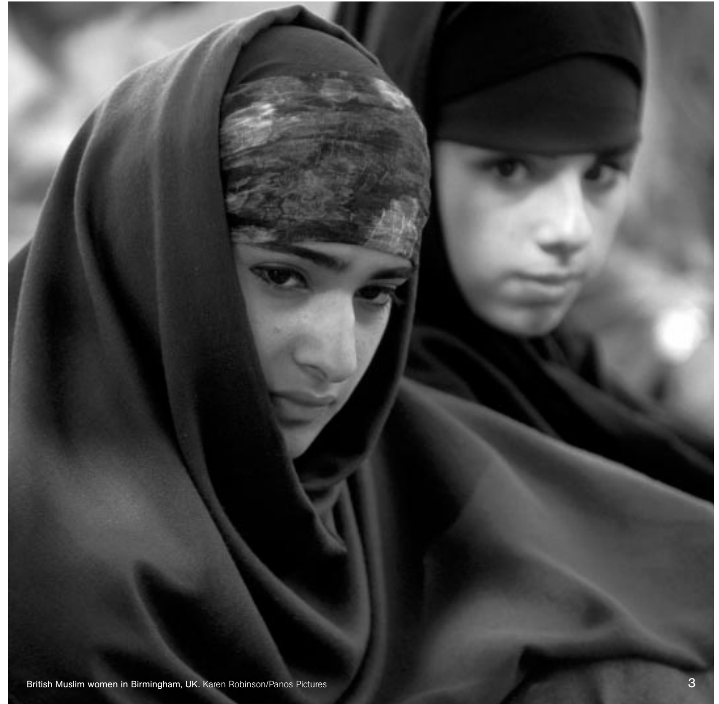
British Muslim women in Birmingham, UK.

More importantly, over half of a sample of participants contacted six months after completing their respective training programmes explained how they had applied what they had learnt by representing their communities. One used materials on minority rights in a course for teachers of secondary school pupils in the Kurdish region of Iraq, another organization was invited to participate in consultations on the World Bank's Poverty Reduction Strategy Paper for Serbia, and an organization in Russia ran a training course to pass on to others knowledge and skills for the international protection of minority rights.