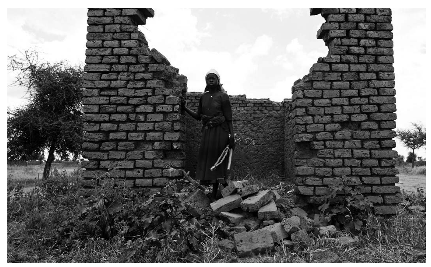
A displaced Sudanese girl from the Fur tribe stands among ruins at a destroyed village near Kass, South Darfur.

The longer Darfur's conflict goes on, the more complicated is the task of ending fighting, resolving