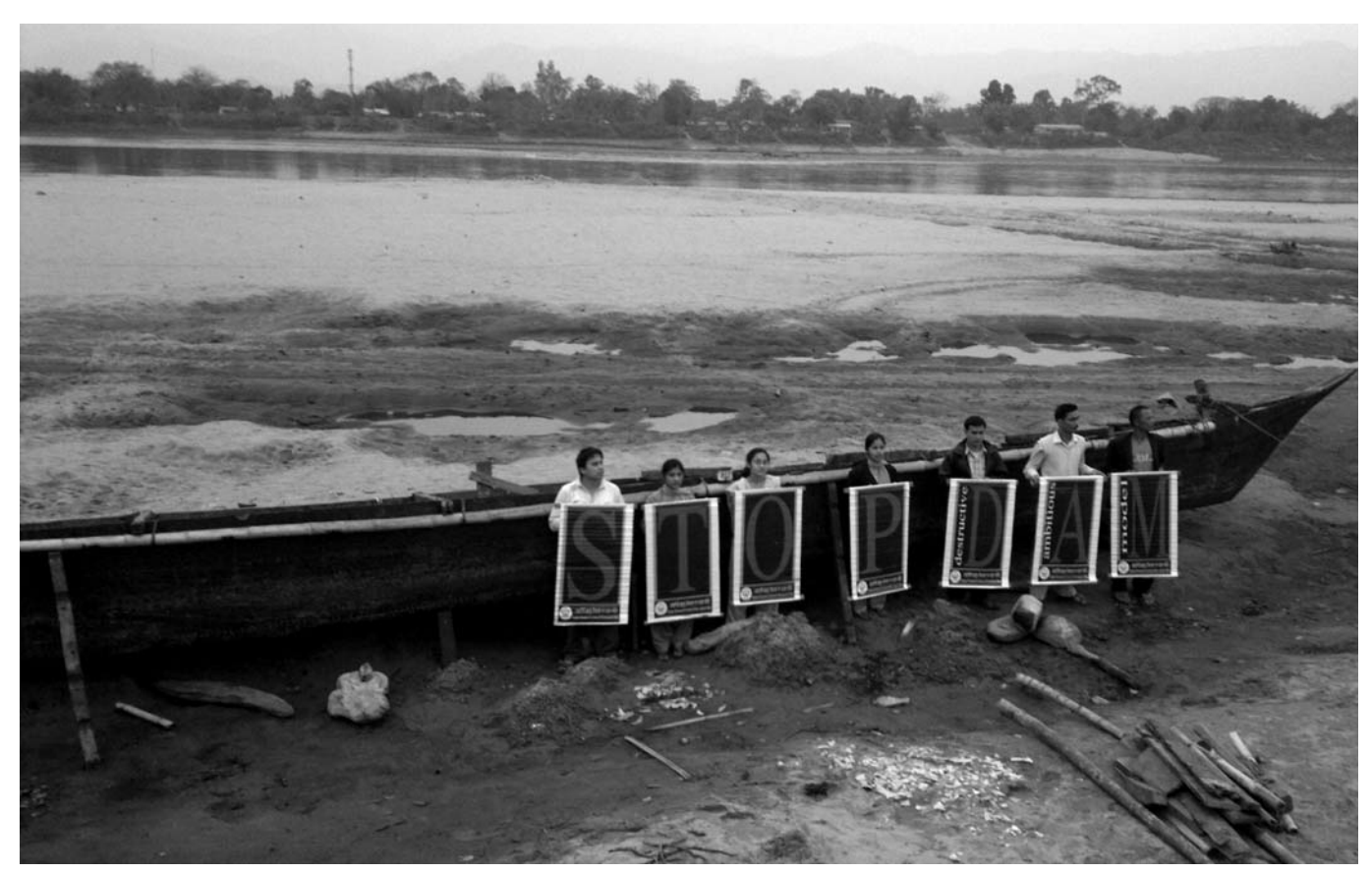
DEMONSTRATION AGAINST DAMS IN SUBANSIRI VALLEY, INDIA. INTERNATIONAL RIVERS

Though they do not provide redress, these campaigns are proving remarkably successful in shifting public opinion outside the region in favour of big mining and driving a wedge between tribal and non-tribal communities. In this state of exception, displacement becomes 'creating a good investment environment' and any opposition to the violation of domestic and international law becomes an act of terrorism, never to be spoken of out loud.