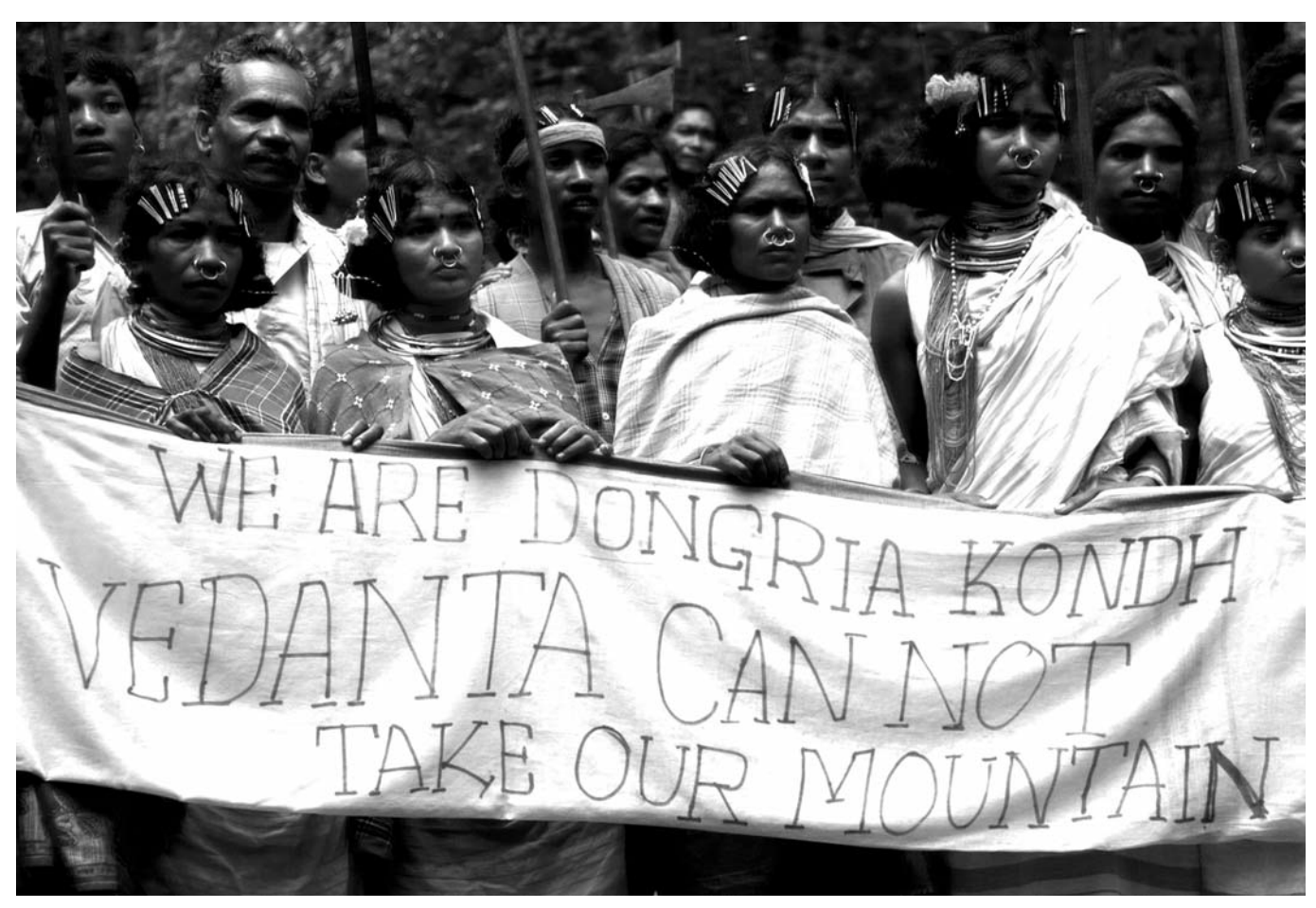
DONGRIA KONDH PROTEST AGAINST VEDANTA RESOURCES, NIYAMGIRI, INDIA. SURVIVAL

Extractive and development projects inevitably give rise to alterations to the environment, and can cause extensive damage. This begins with the construction of infrastructure, including the roads, housing, power, water and waste facilities, and continues throughout the operation of the project, which may entail use and disposal of toxic chemicals. All this can cause the landscape to be