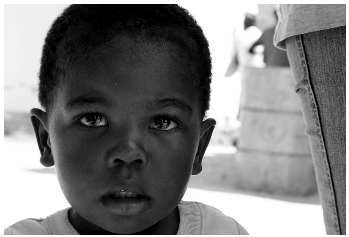
BASARWA CHILD IN BOTSWANA. JON RAWLINSON