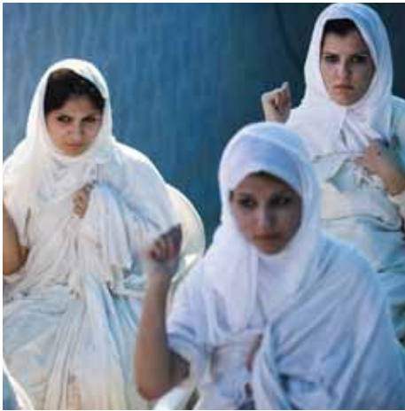
Top: Sabeen-Mandaean brides participate in a wedding ritual on the banks of the Tigris River, Baghdad, Iraq.