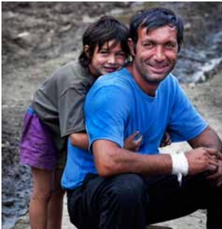
Above: A Roma father and son take a break from picking porcini mushrooms in a forest on the Apuseni mountains, Romania.