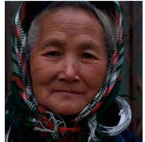
Left: An Adivasi man and his son in Kankasarpa village, Odisha state, India.

iSEE's campaign has already resulted in some positive outcomes. The media – including newspapers read by policy-makers in the National Assembly – has started to expose negative stereotypes and cover issues of cultural identity and language loss. But Thao is realistic about the immediate impact: 'Although concrete actions have not been realized, with the Declaration as a supporting document, the voice of minority communities has reached top policy-makers.'