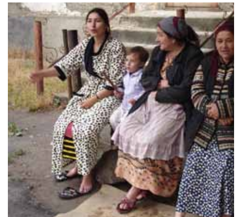
Right: Roma women in Moldova.