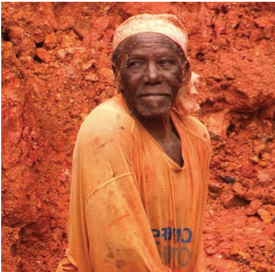
Above: An Afro-Colombian miner from the Cauca region, Colombia.

In Colombia, Afro-descendant communities have the constitutional right to be consulted on development projects, such as mining exploration, that are conducted in areas where they traditionally reside and practise small-scale mining. Despite these constitutional protections, numerous mining exploration permits have been granted to foreign companies without their knowledge or consent. Moreover, Afro-descendant community leaders have been killed or threatened. In April 2011, the Constitutional Court ruled that new mining activities should be suspended and that affected communities must be adequately