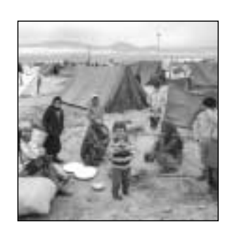
Tajik refugees, Sakhi camp, Mazar-i-Sharif, Afghanistan.