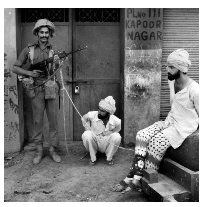
Sikhs being rounded up by the Indian Army in Amritsar, Punjab, 1984.

It is important to understand the conditions and problems of minorities in India. First, despite a relatively impressive array of constitutional and legislative guarantees, and the establishment of a broad range of institutions, autonomous bodies and commissions to monitor and protect the rights of minorities, India's disadvantaged and marginalized segments find their access to power and judicial redress blocked by a coalition of powerful forces. Minorities face discrimination, violence and atrocities. Constitutional and legislative protections have not prevented periodic pogroms against religious minorities, as in Gujarat in 2002, when more than 2,000 Muslims were killed, or in the riots following Indira Gandhi's assassination that led to the murder of 3,000 Sikhs in Delhi alone. The government