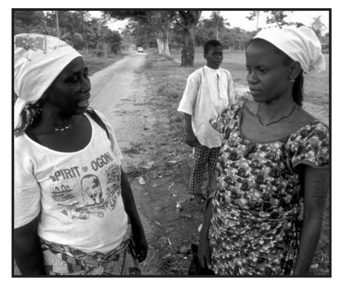
MOSOP supporters on the way to a meeting.

In 1978 a controversial Land Use Decree was passed. It vested ownership and ultimate rights over land in the government and determined that compensation for land would