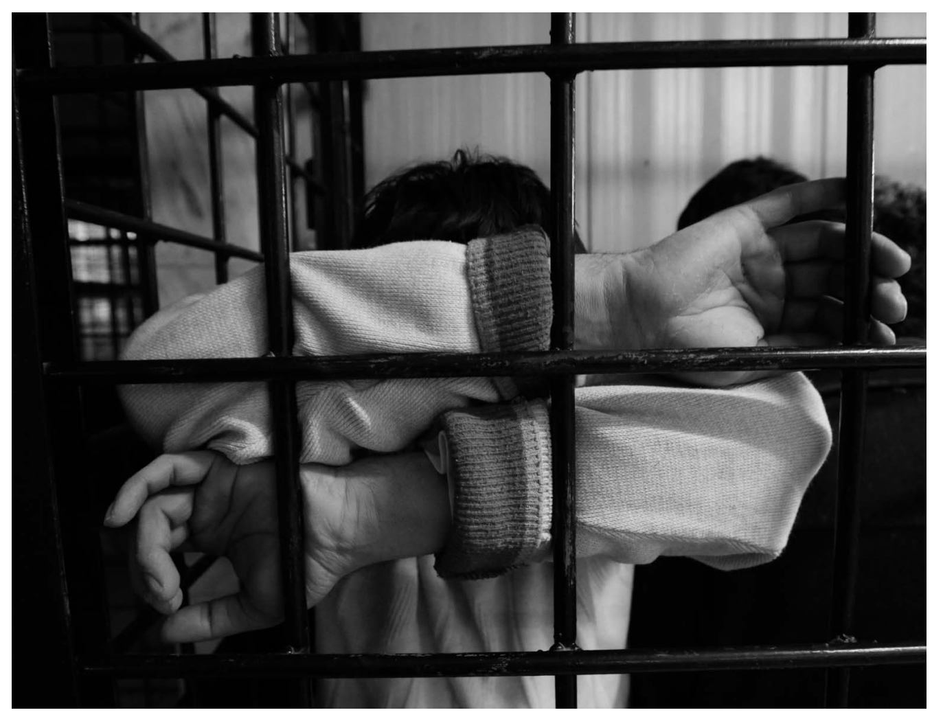
A detained illegal immigrant from a former Soviet republic waits in a holding cell at a police station in Russia's Siberian city of Krasnoyarsk. Ilya Naymushin / Reuters, September 2013.

According to the 2010 census, there are 205,000 Roma in Russia. Their communities are plagued by sub-standard living conditions, difficulties in socio-economic integration and, at times, segregation of children in schools. Both migrant and Roma settlements have been targeted by law-enforcement officials.