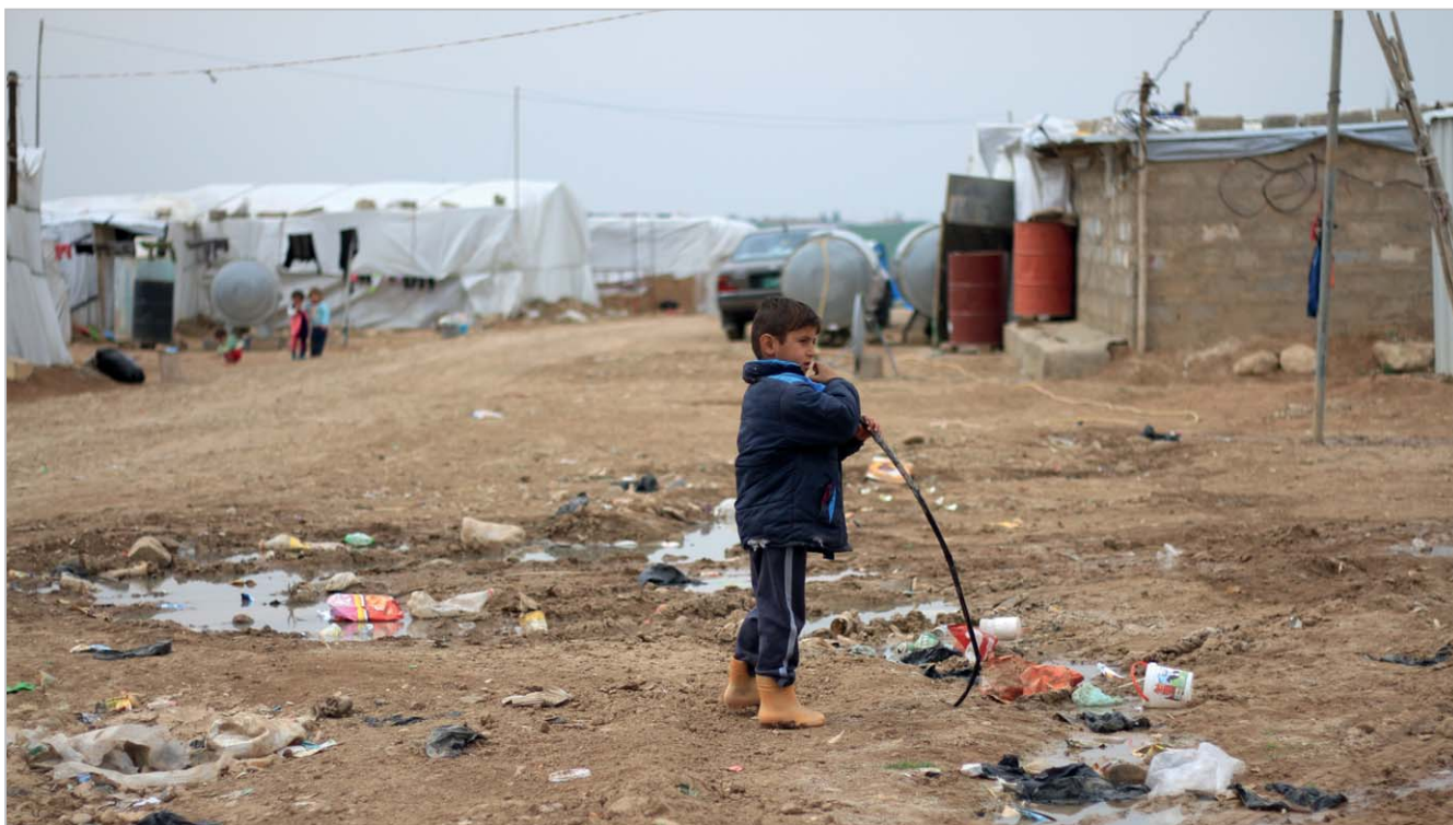
KHANKE INFORMAL CAMP, DOHUK

Christian military commander, Dohuk, March 2017