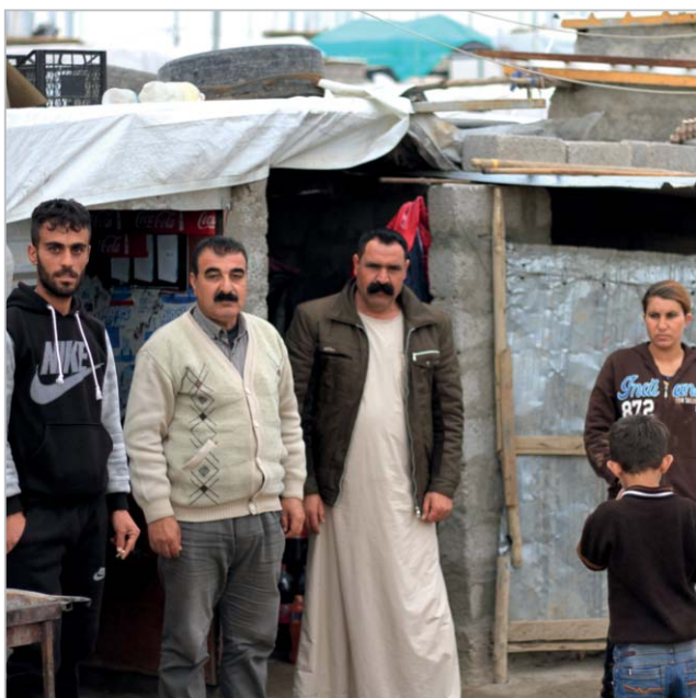
INTERNALLY DISPLACED PERSONS IN KHANKE INFORMAL CAMP, DOHUJ

Prior to June 2014, half or more of the pre-2003 Iraqi Christian community – thought to number between 800,000 to 1.4 million – had already left the country. This includes Armenian Catholics and Orthodox, Assyrian Church of the East members, Assyrian Orthodox, Chaldean Catholics and Orthodox, Evangelicals, Protestants, and Syriac Catholics and Orthodox. 13 Many consider these