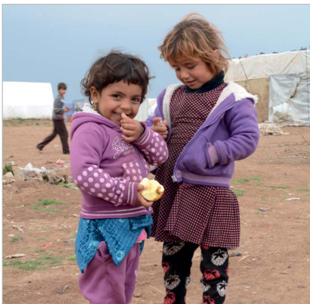
IDP CHILDREN, NORTHERN IRAQ / ALESSANDRO MANNO

In the first two weeks of August, ISIS expanded its occupation of northern Iraq, capturing Sinjar, Mosul Dam, Kocho and other areas north and west of Mosul, as well as Qaraqosh and other towns and villages to the south and east. The group subsequently advanced to within 40 kilometres of Erbil, capital of the KR-I.