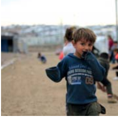
Yezidi girl, from Khanke camp, near Dohuk