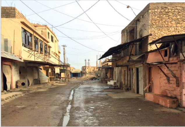
A VACANT TEL ESKOF STREETScape / WILLIAM SPENCER

The focus of much recent media coverage has been the steady rollback of ISIS forces from its former territory, with military and paramilitary forces regaining control of large swathes of the Ninewa plains in the latter months of 2016 and the ongoing battle to secure the remaining areas of ISIS-occupied Mosul. On the face of it, this would suggest that the atrocities and mass displacement that began with the group's sweep across northern Iraq in the summer of 2014 could soon come to a close.