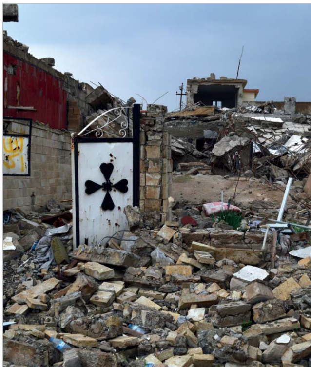
DESTROYED CHURCH BUILDING, TAL KAIF DISTRICT, NINEWA GOVERNORATE / MAYS AL-JUBOORI

While it is certainly a matter of the utmost urgency to provide humanitarian assistance to populations affected by the war and to meet their security needs, it is equally crucial to address the root causes of the conflict. 165 In this way, the international community can assist in finding lasting political solutions by addressing the grave injustices that caused it. Transitional justice – defined by the UN as ‘the full range of processes and mechanisms associated with a society’s attempt to come to terms with a legacy of large-scale past abuses, in order to ensure accountability, serve justice and achieve reconciliation’ 166 – is an important vehicle to achieve this. Possible approaches to achieve these ends in Iraq are explored further in this section.