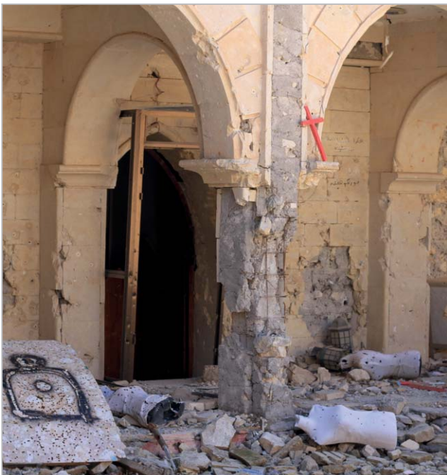
THE DESECRATED CHURCH OF THE IMMACULATE CONCEPTION IN QARAQOSH, USED BY ISIS FOR TRAINING FIGHTERS AND TARGET PRACTICE

This section discusses some of the challenges that displaced minority members continue to experience in Iraq almost three years after the fall of Mosul to ISIS.