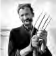
Farmer from the ancient Uyghur settlement of Kelpin, Xinjiang Uyghur Autonomous Region.