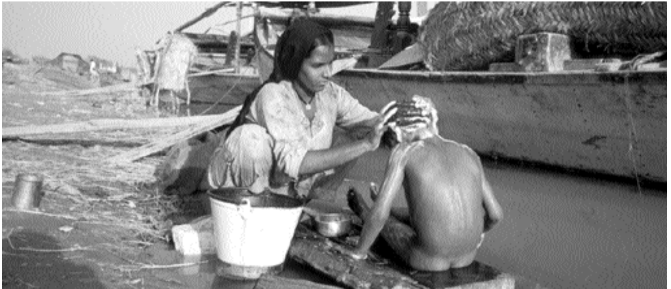
Washing on the banks of the Indus, Pakistan